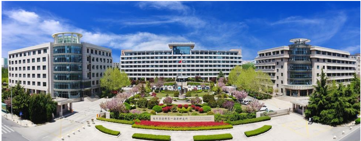
First Institute of Oceanography (FIO), Ministry of Natural Resources of China