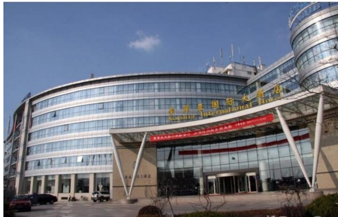
Address: Hongkong E Road 217, Laoshan District, 266000 Qingdao