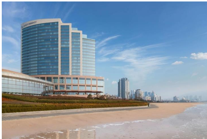
Address: No. 88 East Dong Hai Road, Laoshan District, 266061 Qingdao

The payment accepts cash and credit card (both for VISA and MASTERCARD).